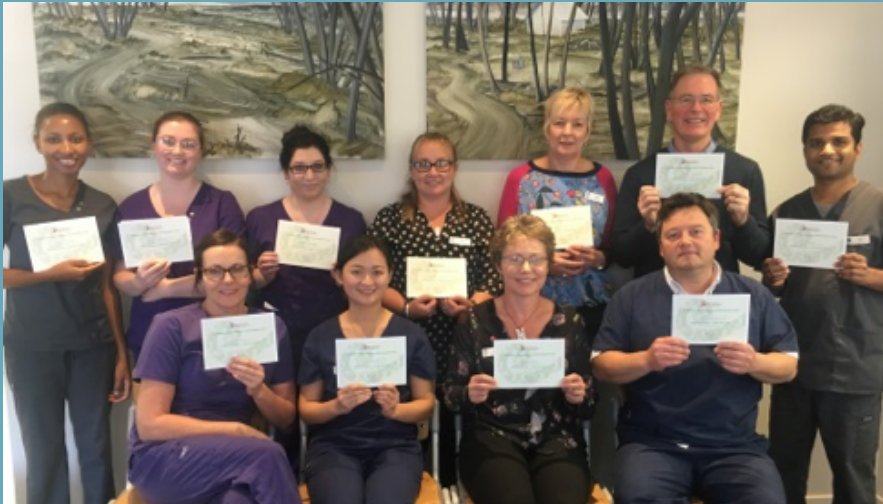
Recent Staff training in New Zealand Resuscitation